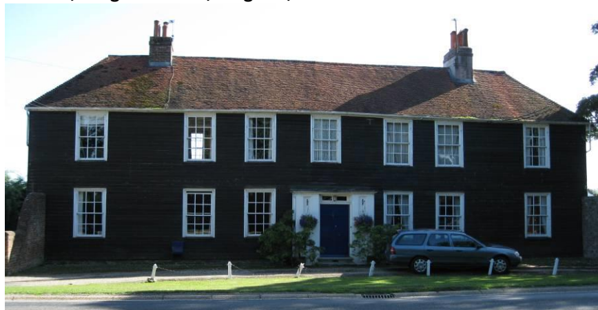
Officers' Quarters (listed)

Back Green Cottage (above left) is a small two-storey cottage, partly plastered and partly tile-hung, located across Church Hill from Ringmer churchyard. It is the only survivor of a row of five cottages and a larger house (variously used as a beerhouse, lodging house and laundry; above right) built by carpenter James Packham on land enclosed from Ringmer Green in 1820. The house and all five cottages were built before 1831, when James Packham's property was advertised for sale. Usually occupied by labourers or village artisans, Back Green Cottage was Ringmer's first Police Station between 1853 and 1863.