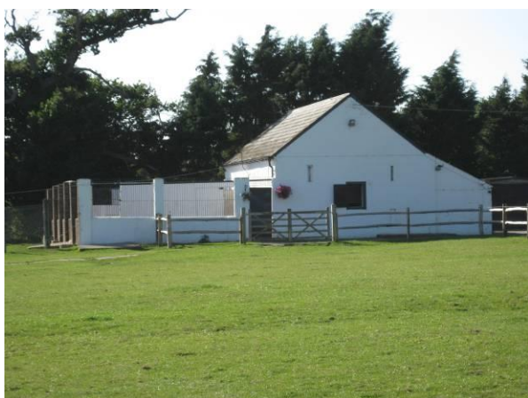
Barracks magazine (now hunt kennels)